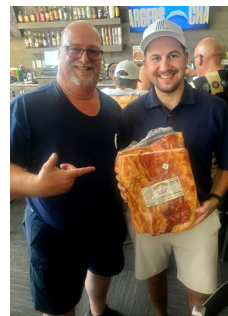
Give one of our Meat Raffles a try — winners go home with dinner!

January 25 — 6:00pm Bingo at The Silver Spike Bar & Grill in Dilworth, MN