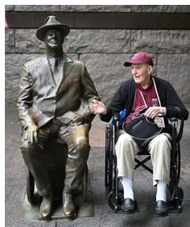
He attempted to shake FDR's hand ... but the gesture was not readily returned