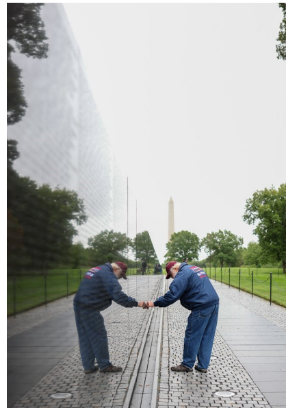
Your tax-deductible donations allow more Veterans to experience the healing and camaraderie of an Honor Flight

The Caring Catalog is an online giving platform that aims to help connect community members with local nonprofits during the most generous time of the year — the holiday season.