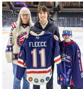
Winning bidders take home a game-worn hockey jersey!

January 15 — 5:30pm Meat Raffle at Wild Rice Bar & Grill in Wild Rice, ND