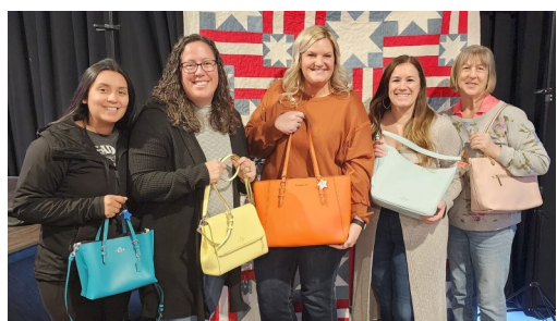
Many lucky ladies showing off their new handbags after winning a Purse Bingo game

Twice per year the handbag aficionados come out to try their luck at winning one of 15 designer purses in this fun and frenzied event!