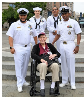
Four active duty sailors stopped to pay their respects while at the US Navy Memorial

As a former Navyman, it was also very touching to him when four uniformed, active duty sailors stopped him while touring to thank him for