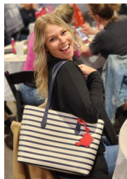
Purse Bingo is the MOST fun!

November 6 — 5:30pm Meat Raffle at Wild Rice Bar & Grill in Wild Rice, ND