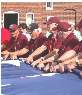
Veterans on the Bravo Flight help with the Great Garrison Flag retreat at Fort McHenry on day one of the trip.

With a waiting list of approximately 850 deserving Veterans, we knew changes had to be made to our flight schedule. In a typical year, we'd see to it that about 200 Veterans made their trip. At that rate, our waiting list would become insurmountable. So rather than taking two flights (or three as we've previously done) in a calendar year, this time we