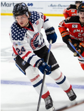
Fargo Force players don patriotic jerseys during our night game

We are thrilled to be selected again for a featured Jersey Night at the Fargo Force hockey game!