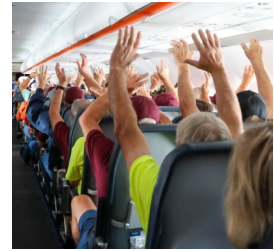
Bravo Flight Veterans, Volunteers, and Escorts keep the blood flowing during a group exercise mid-flight